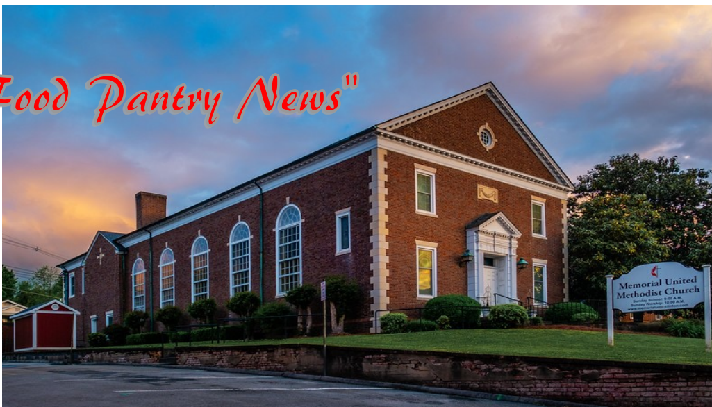
Memorial United Methodist Church on Main Street in Clinton.